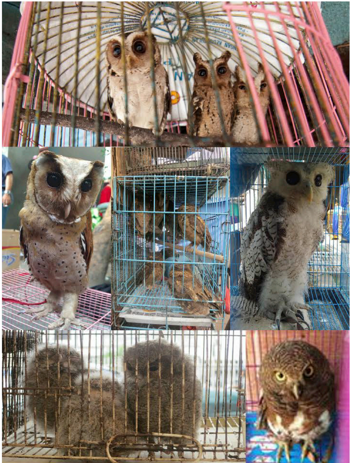
Fig. 3. Owls for sale in bird markets in Java. From top, clockwise. Scops owls, juvenile barred eagle owl, Javan owlet, juvenile scops owls, Oriental bay owl. Centre: scops owls.

this time the first Indonesian pet owl community Facebook pages had been set up, and websites offered advice on how to care for pet owls were available, quite possibly also in response to the Harry Potter films and novels. Furthermore, the availability