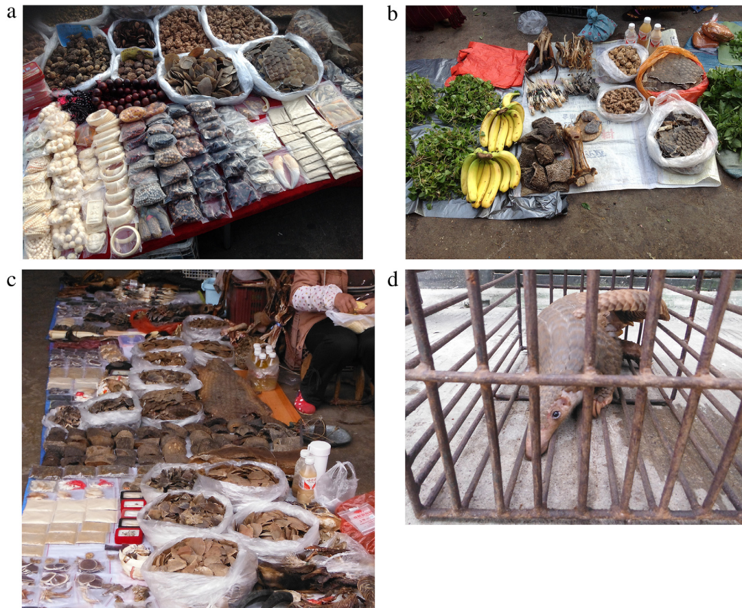
Fig. 1. Pangolin trade in Mong La showing clockwise from top left (a, b) bags of pangolin scales in the central wet market (c) bags of pangolin scale and whole pangolin skin in the central wet market, (d) live pangolin in a cage awaiting slaughter in front of the wild meat restaurants.

but given that the restaurants and casinos were not surveyed in 2015 volumes during the latest visit were equal or larger of that in 2013–2014. Given the prominence of the pangolins in trade during the later surveys it is highly unlikely that we would have missed significant quantities of pangolins during the first two surveys. This then suggests an increase in the prominence of pangolins in trade in Mong La, similar as observed for ivory (Nijman and Shepherd, 2014). All other reports of wildlife for sale from the period 2003 to 2005 (i.e. prior to our first visit) mention pangolins for sale but unfortunately none quantified volumes in trade (Davies, 2005; Felbab-Brown, 2011; Peterson, 2007). While the price of scales and skins can be reliably extrapolated to larger volumes, this is more complicated for the trade in live pangolins, pangolin meat or pangolin wine. Live pangolins in Mong La are mostly displayed in front of restaurants or casinos and are purchased not whole but as part of a dish. Likewise, pangolin wine is purchased by the glass or by the bottle, and the price holds little relationship with the number of pangolins emerged in the wine. Nevertheless, the combined retail value of the pangolins in Mong La makes the sale of pangolins an important economic contribution to the local economy, and certainly to those in control of the flow of pangolins.